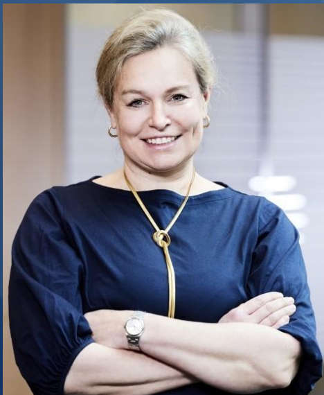
Lawyer and independent management consultant